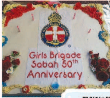
GB SABAH 50TH ANNIVERSARY