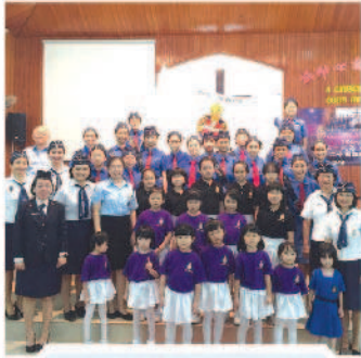
1ST SRI AMAN 20TH ANNIVERSARY