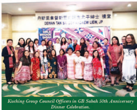
Kuching Group Council Officers in GB Sabah 50th Anniversary Dinner Celebration.