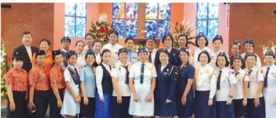
Group photo taken during Sunday Service at Paya Lebar Methodist Church, Singapore.