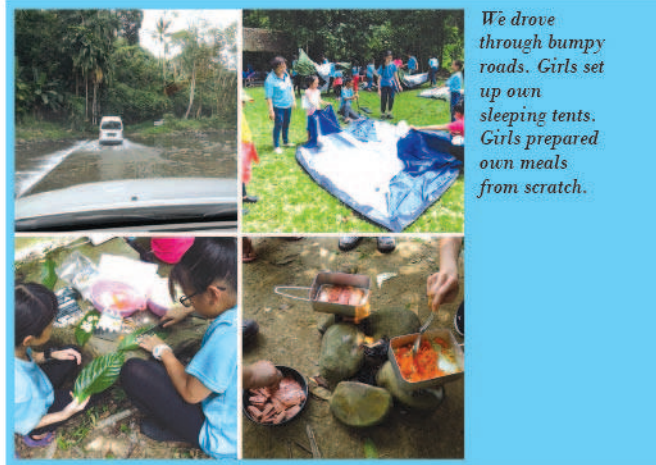
We drove through bumpy roads. Girls set up own sleeping tents. Girls prepared own meals from scratch.

The Officers are exhausted but its's all worth it as we are happy to observe Girls' lives transformed, God's world enriched. There are few of our introverts senior girls took part actively along and get to lead the little ones. Praise the Lord for the journey mercy, protections, joy and good weather.