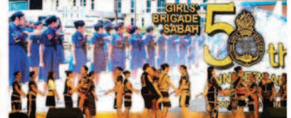
Various performances during GB Sabah 50th Anniversary Dinner Celebration.