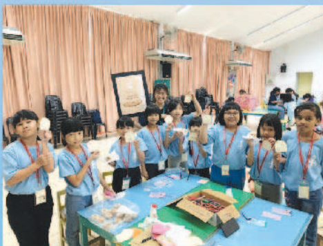
Girls at the 'Give us this day our daily bread' station showing their completed craft.