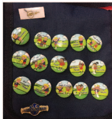
Way of GB England girls place their awards on a bag