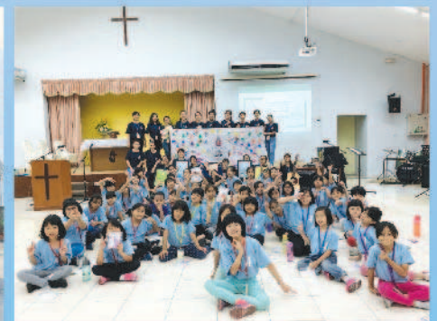
Group photo taken together with the hand print banner stamp by all girls and officers.

Praise and Worship session where girls learn the action song for the theme song, 'The Lord's Prayer.'