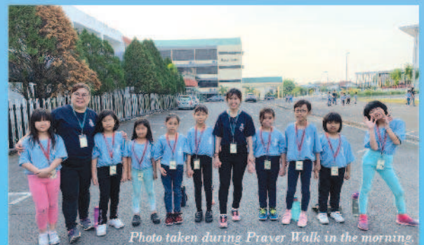
Photo taken during Prayer Walk in the morning.