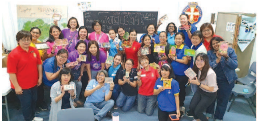
Officers and their end product!