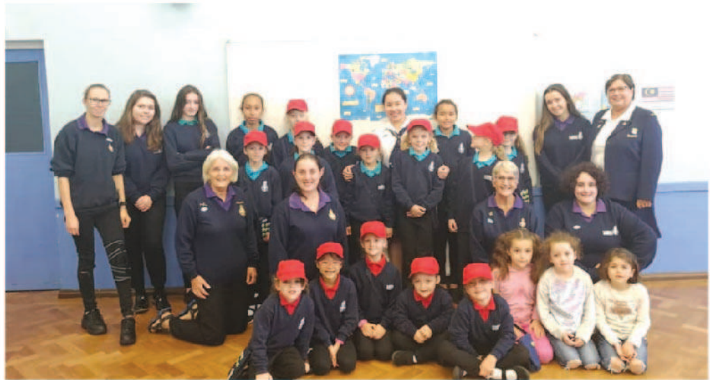
4th Morden, GB England

In Malaysia, it's most likely only summer or rainy season throughout the year, so our uniform is designed to suit us in our weather. I felt cold and chilly in my uniform when I visited the company as it was winter. England has 4 different seasons, hence, the