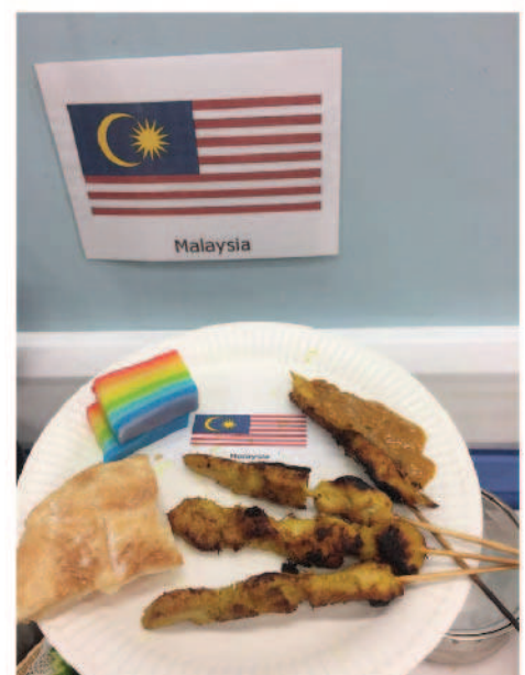
Malaysia food prepared in England.