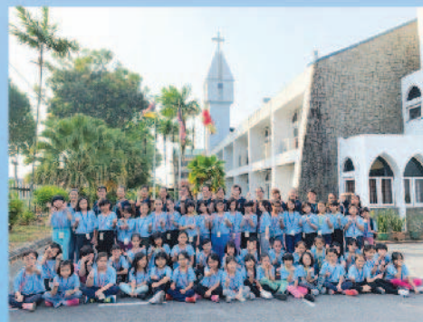
Group photo in camp T-shirt.