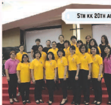
5TH KK 20TH ANNIVERSARY