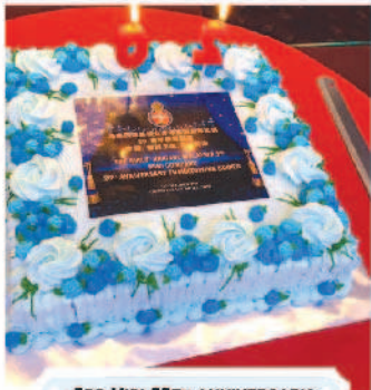
3RD MIRI 20TH ANNIVERSARY